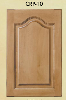
CRP-20 Specie: Hard Maple Finish: Autumn