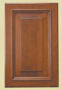
Churchill Specie: Cherry Finish: Washington Cherry