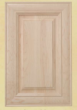
CRP-10875 Specie: Hard Maple Finish: Natural